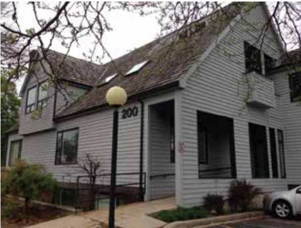
Busy Barrington location with high visibility in an established business community.