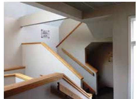
Well appointed and maintained building with numerous interior amenities from common area restrooms to operable windows with scenic views on all sides.